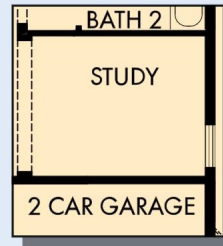
OPTIONAL STUDY AT BEDROOM 3